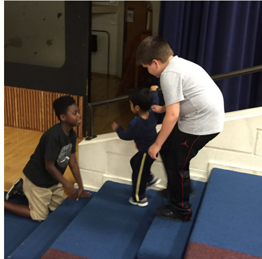
A lesson plan in progress. The objective was to support the developmental area of gross motor skills, specifically focusing on access of the stairs and walking up and down reciprocally.

Throughout the years our fifth graders have chosen to be community activists for change.