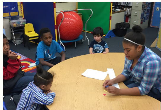
This lesson targeted copying and extending patterns. Students started on the floor by creating patterns with musical instruments, then moved to the table to use colors and shapes to create and extend patterns on a sentence strip.